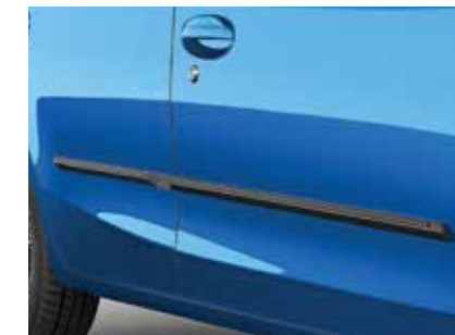
SIDE PROTECTION MOULD