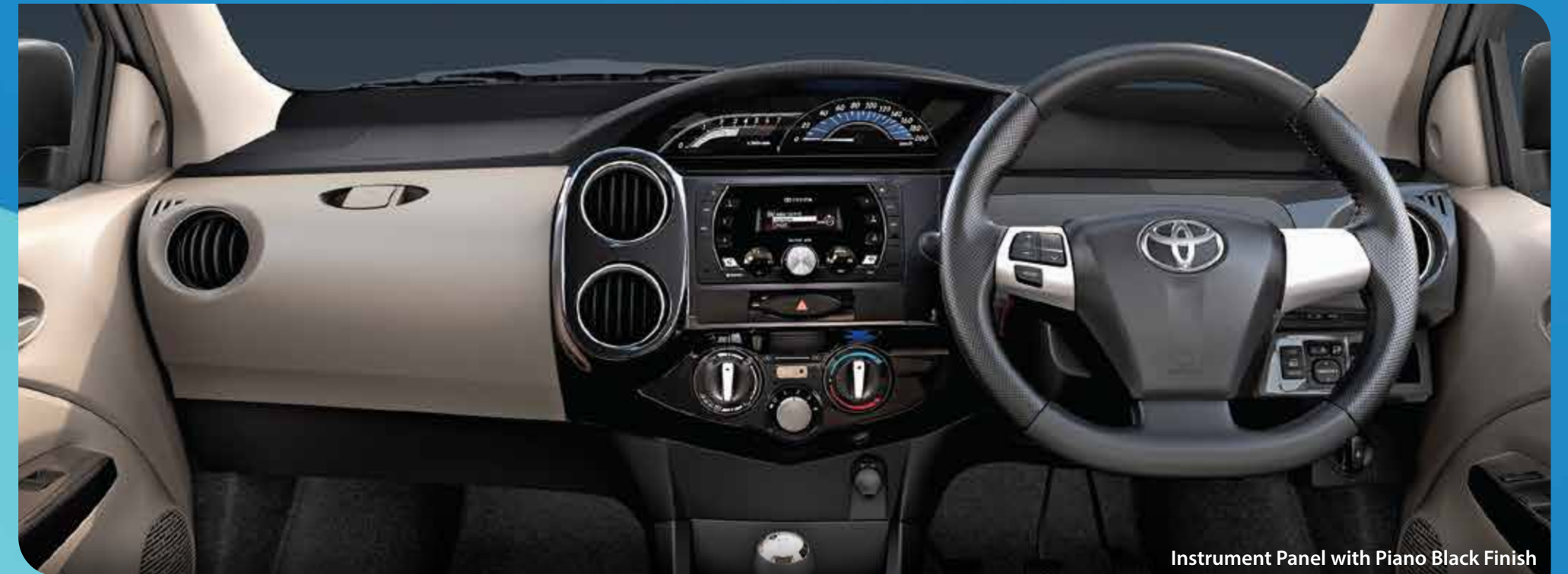
Instrument Panel with Piano Black Finish

Say hello to the trendiest hatch in town! The new Dual-Tone Liva comes with an eye-catching stylish design, and an array of new and exciting features.