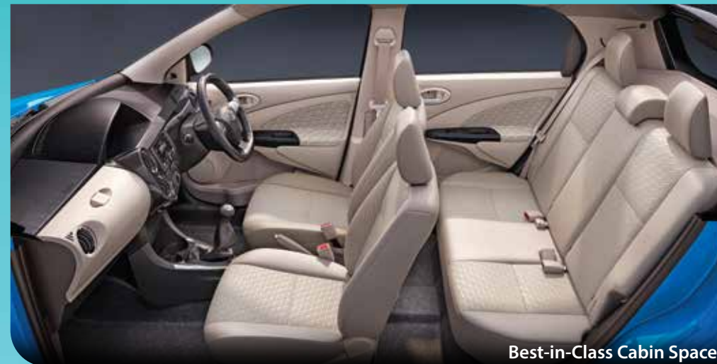
Best-in-Class Cabin Space