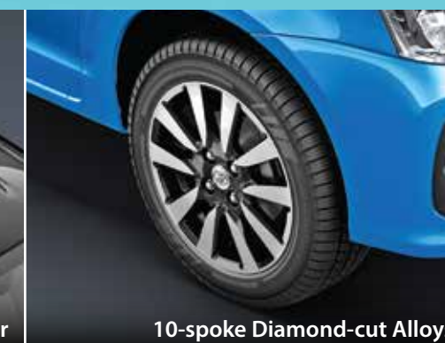
10-spoke Diamond-cut Alloys