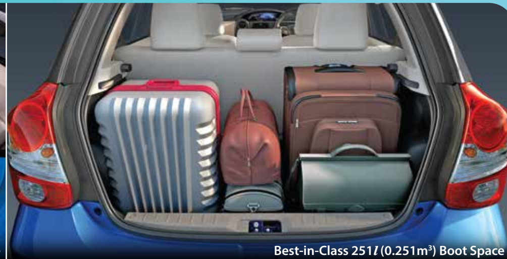
Best-in-Class 251l (0.251m 3 ) Boot Space