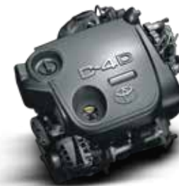
Powerful 1.4l Diesel Engine