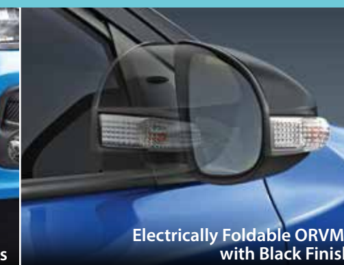
Electrically Foldable ORVMs with Black Finish