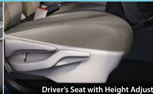
Driver's Seat with Height Adjust