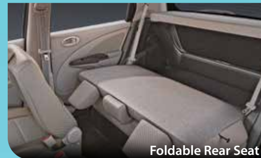
Foldable Rear Seat