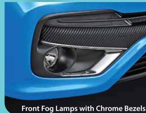
Front Fog Lamps with Chrome Bezels

Discover style that makes sense only with the new Dual-Tone Liva. Get features that offer unmatched safety, comfort and quality, in an attractive new dual-tone design and an exciting new look. The new Dual-Tone Liva's painted roof contrast is a direct factory build. A first in this segment.