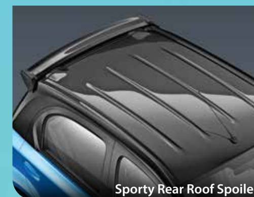
Sporty Rear Roof Spoiler