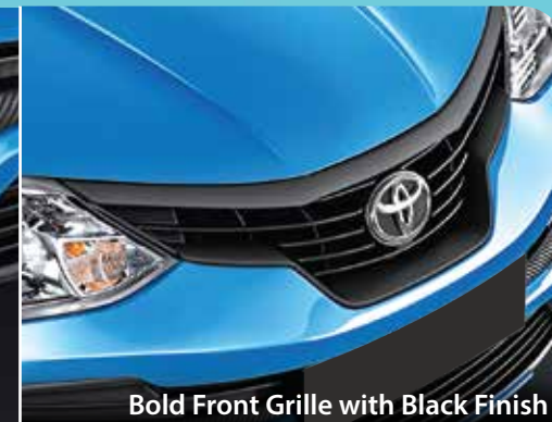
Bold Front Grille with Black Finish