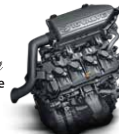
Refined 1.2l DOHC Petrol Engine

*Cost of scheduled periodic maintenance job upto 1,00,000km. ** Conditions apply.