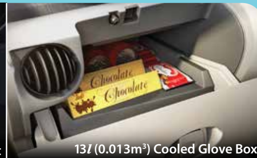
13l (0.013m 3 ) Cooled Glove Box