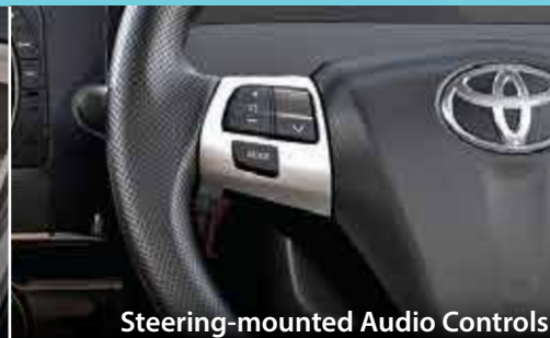
Steering-mounted Audio Controls